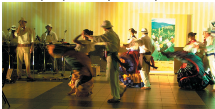
Musicians and dancers from Costa Rica entertaining the delegates during the official dinner

FOURTEENTH SESSION OF THE UN COMMISSION ON SUSTAINABLE DEVELOPMENT, CSD-14: 1-12 May 2006, New York, USA. CSD-14 will begin the second implementation cycle of the Commission's new work programme and will review progress on atmosphere/air pollution, climate change, energy and industrial development. For more information contact: UN DSD; tel: +1-212-963-2803; fax: +1-212-963-4260; e-mail: dsd@un.org ; Internet: http://www.un.org/esa/sustdev/