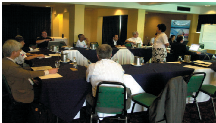
Delegates during the Working Group on Urban Planning and Waste Management